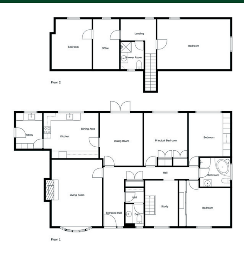
Sizes And Dimensions Are Approximate. Actual May Vary.