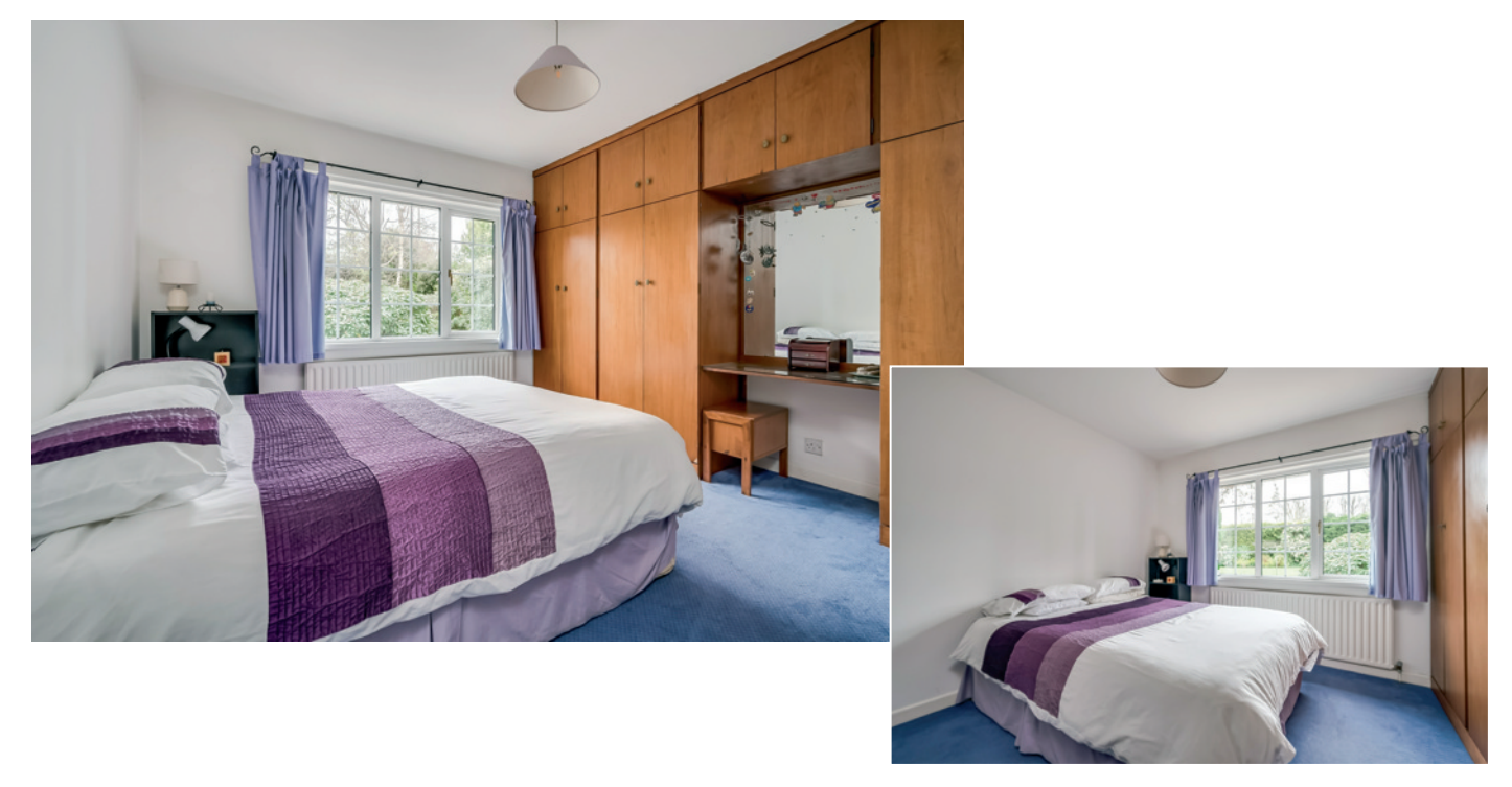
BEDROOM (3): 14' 1" \times 11' 2" (4.29m \times 3.4m) (at widest points). Built-in robes and dressing table.