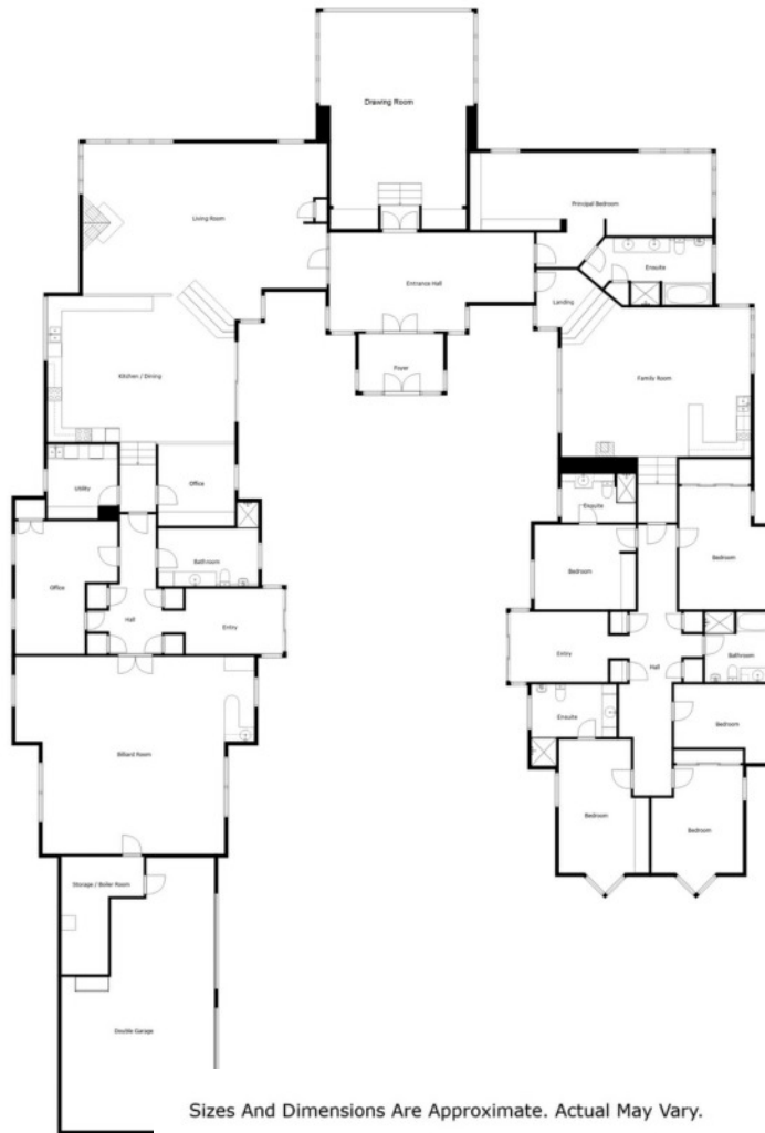
Sizes And Dimensions Are Approximate. Actual May Vary.

Lisburn Road - 028 90 66 3030 Ballyhackamore - 028 90 65 0000 Lisburn - 028 92 66 1700 North Down - 028 90 42 4747 www.templetonrobinson.com