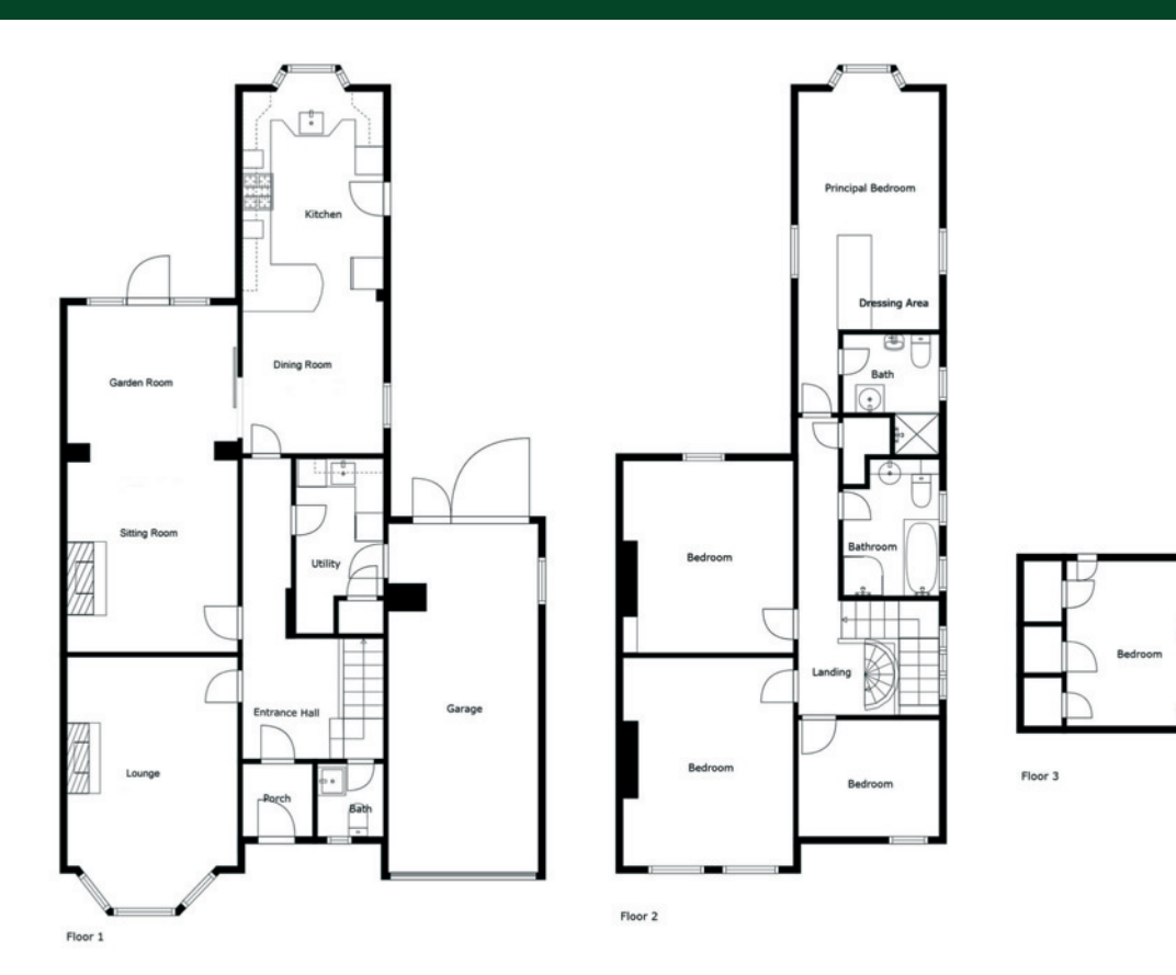
Sizes And Dimensions Are Approximate. Actual May Vary.