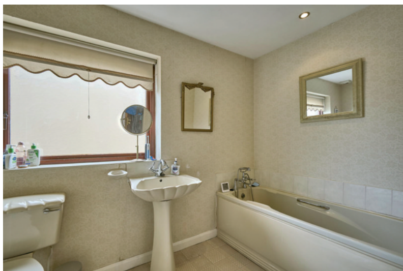
BATHROOM: Coloured bathroom suite comprising panelled bath with mixer tap and telephone hand shower, pedestal wash hand basin, low flush wc, walk-in storage cupboard with thermostatic shower unit, LED lighting.