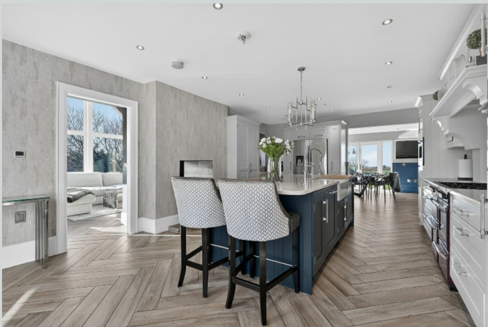
DINING ROOM: 15' 1" x 12' 10" (4.6m x 3.9m) Panelled walls. Triple aspect windows. uPVC double glazed French doors to garden. Ceramic tiled floor, low voltage spotlights.