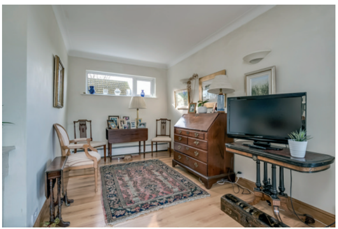
DINING ROOM: 12' 8" x 9' 2" (3.86m x 2.79m) (at widest points). Laminate wood effect floor.