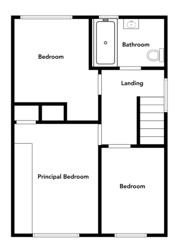
SIZES AND DIMENSIONS ARE APPROXIMATE.