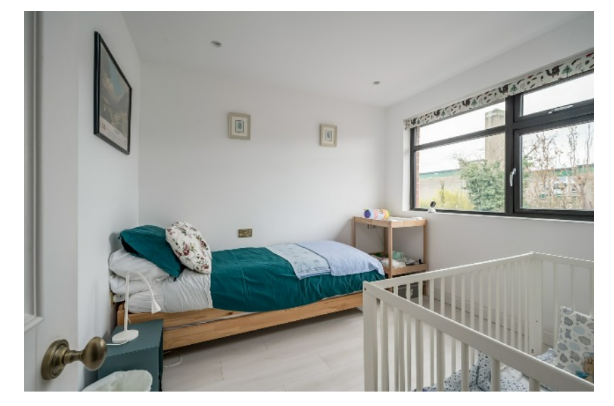
BEDROOM (3): 9' 5" x 7' 3" (2.87m x 2.21m) Laminate wooden floor.