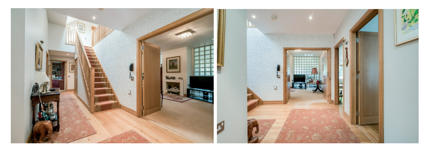
DRAWING ROOM: 18' 10" \times 14' 7" (5.74m \times 4.44m) Feature gas wood effect fire with marble surround and hearth.

RECEPTION HALL: Storage/cloaks cupboard and understairs storage cupboard.