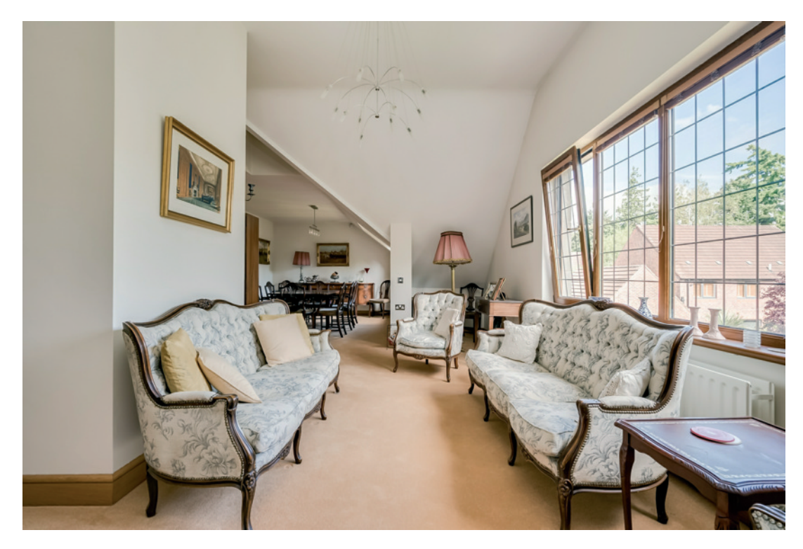
DINING ROOM: 13' 8" x 11' 6" (4.17m x 3.51m)