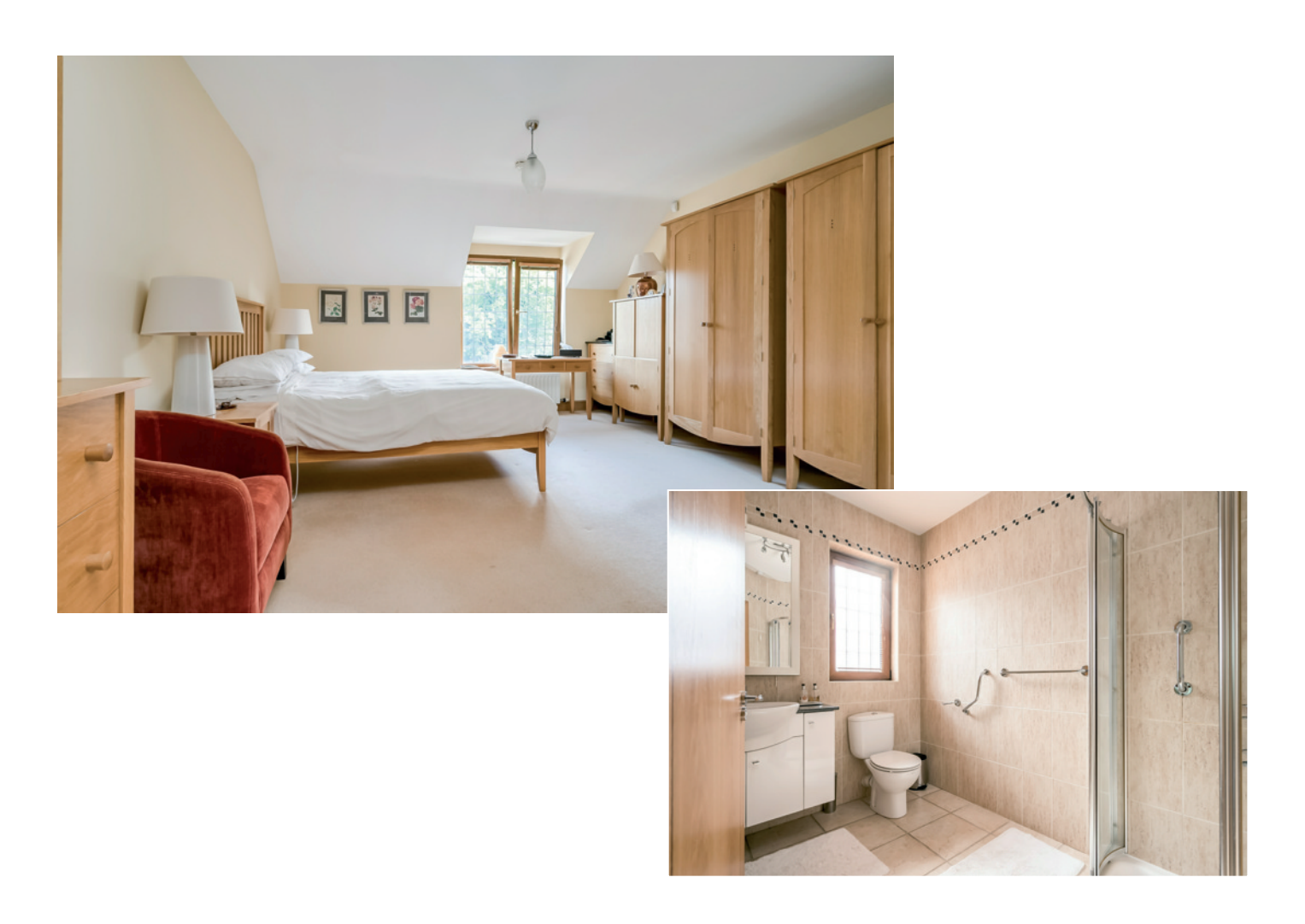
BEDROOM (2): 14' 0" x 10' 9" (4.27m x 3.28m) Walk-in wardrobe.

ENSUITE SHOWER ROOM: Shower cubicle with thermostatically controlled shower unit, low flush wc, wash hand basin, heated towel rail.