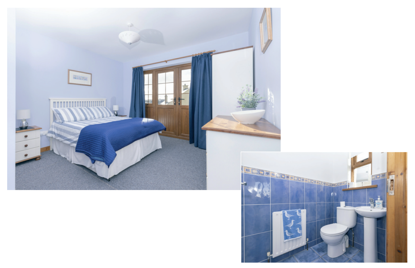
BEDROOM (2): 11' 8" x 10' 9" (3.56m x 3.28m)

BEDROOM (1): 11' 8" \times 10' 4" (3.56m \times 3.15m) French doors with views to Lough Erne. ENSUITE SHOWER ROOM: 7' 7" \times 3' 10" (2.31m \times 1.17m) White suite comprising low flush wc, pedestal wash hand basin, built-in shower cubicle with electric shower, half tiled walls, tiled floor.