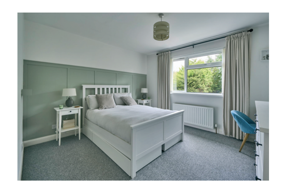
BEDROOM (2): 10' 10" x 8' 10" (3.3m x 2.7m) Wall to wall range of built-in robes.