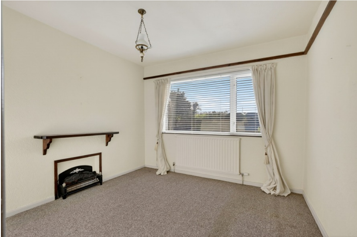
BEDROOM (3): 10' 0" x 10' 0" (3.05m x 3.05m)

SHOWER ROOM: Walk-in shower cubicle with thermostatic shower unit, low flush wc, vanity unit. Hotpress with built-in shelving and copper cylinder.