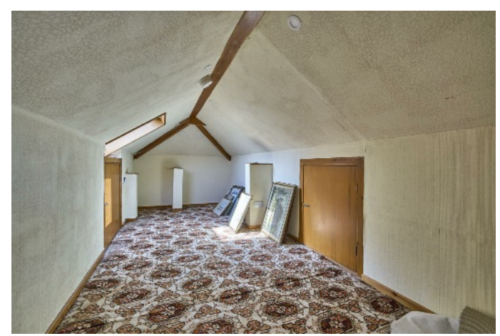
ROOM (2): 19' 4" \times 6' 7" (5.9m \times 2m) Storage in eaves SHOWER ROOM: