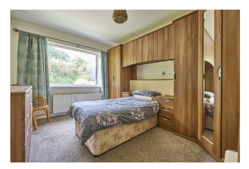
BEDROOM (2): 9' 2" x 8' 6" (2.8m x 2.6m)