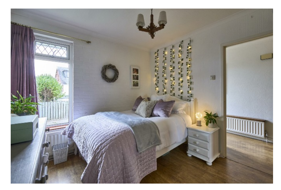
BEDROOM (4): 9' 3" \times 8' 3" (2.82m \times 2.51m) Laminate wood floor, wall to wall range of built-in