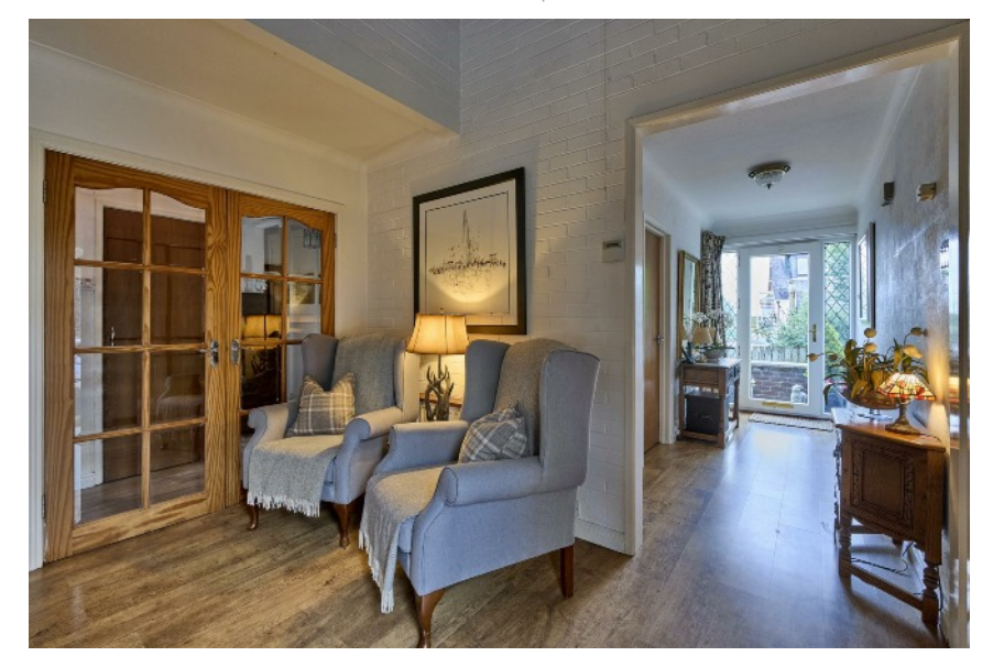
STUDY: 9' 8" \times 9' 5" (2.95m \times 2.87m) Currently used as bedroom 5, laminate wood floor.

ENTRANCE HALL: Laminate wood floor, cloaks cupboard.