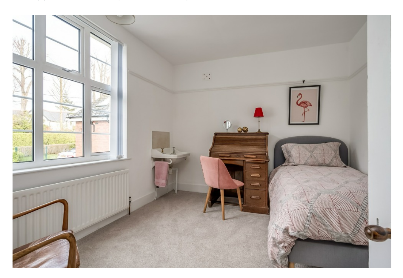
BEDROOM (3): 15' 3" x 12' 6" (4.65m x 3.81m)