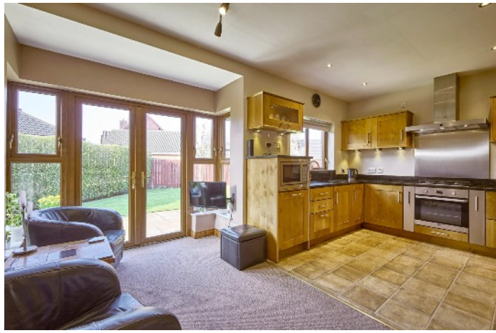
Open plan to:

MODERN KITCHEN WITH CASUAL DINING AREA: 19' 8" x 9' 10" (6m x 3m) Excellent range of high and low level units, Franke stainless steel sink unit with mixer tap, granite worktops, Bosch built-in dishwasher, Bosch built-in eye level microwave, four ring gas hob and built-in oven, stainless steel extractor fan. Service door to garage.