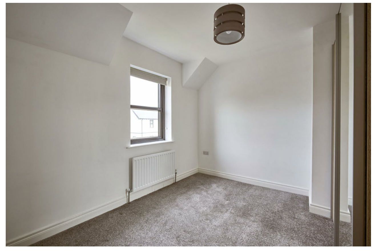
BEDROOM (3): 10' 10" x 7' 0" (3.3m x 2.13m)

BEDROOM (2): 10' 10" x 10' 0" (3.3m x 3.05m) Large full size double wardrobe - to be included.