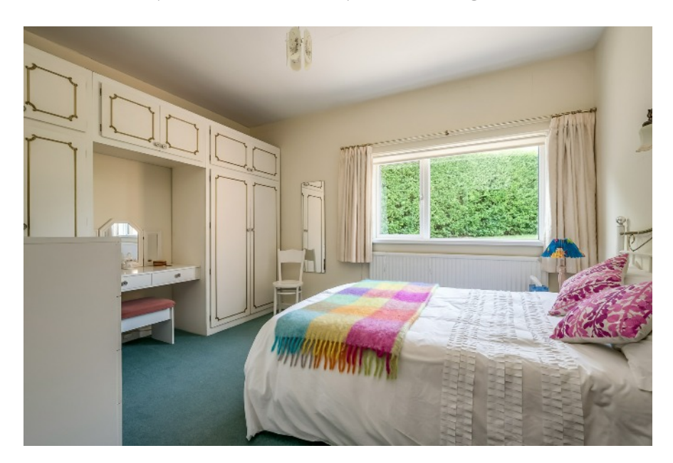
BEDROOM (2): 11' 11" x 9' 10" (3.630m x 3.004m)