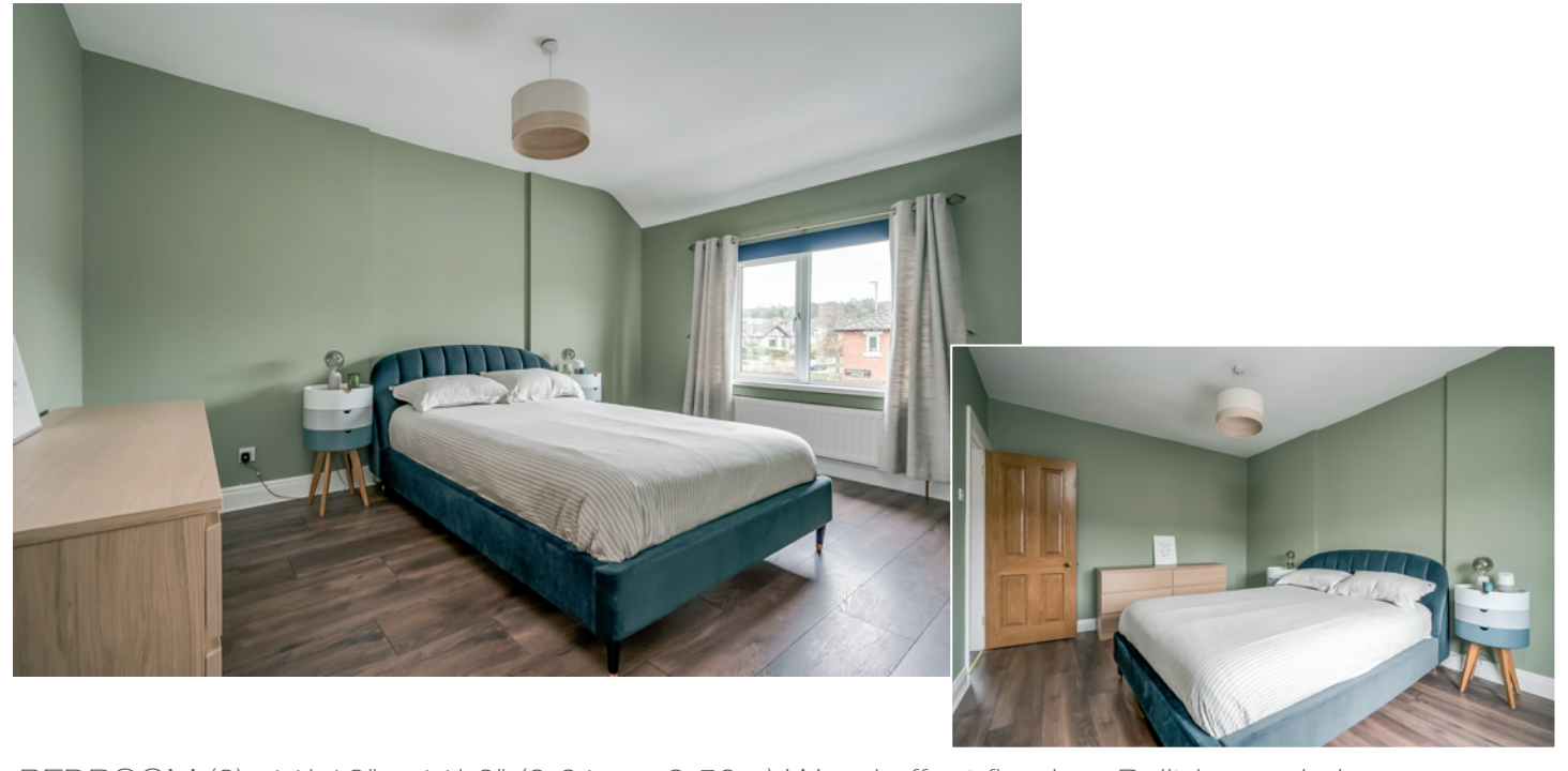
BEDROOM (2): 11' 10" \times 11' 6" (3.61m \times 3.50m) Wood effect flooring. Built-in wardrobe space. Outlook to front.

PRINCIPAL BEDROOM 15' 1" x 11' 1" (4.59m x 3.37m) Wood effect flooring. Outlook to front.