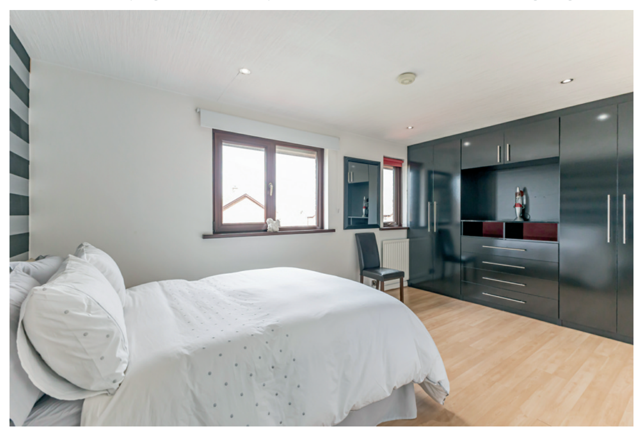
BEDROOM (3): Laminate wood strip flooring.

BEDROOM (2): 14' 7'' \times 9' 7'' (4.44m \times 2.92m) (into wardrobes). Laminate wood strip flooring. Built-in wardrobes with plug sockets and space for television. Recessed LED lighting.